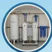
محطة أوكسجين متكاملة