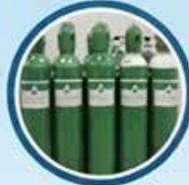
أسطوانات أوكسجين طبي