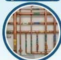
أنابيب نحاس طبي أفرعنا:

الفرع الرئيسي: اسطنبول - المنطقة الصناعية ايكي تلي فرع ثاني: حلب المدينة الصناعية الشيخ نجار فرع ثالث: صوران اعزاز المدينة الصناعية فرع رابع: حلب - الباب المدينة الصناعية الاولى