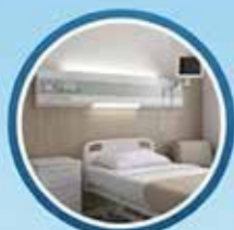
وحدة رأس سرير المريض

- تأسست شركة قندوسة للغازات الطبية والصناعية والتجهيزات الطبية [1985]، وهي شركة رائدة في مجال الغازات الطبية والصناعية و التجهيزات الطبية وأجهزة توليد اللوكسجين، نحن ملتزمون بتقديم حلول شاملة ومبتكرة في مجالنا، مع الالتزام بالجودة وأدق التفاصيل، وتتمتع بتجربة طويلة في هذا المجال، حيث قام فريقنا بتنفيذ مشاريع متنوعة وناجحة في مختلف القطاعات، ونسعى دائماً لتحقيق أعلى مستويات الجودة في كل جانب من جوانب مشاريعنا، من التخطيط إلى التنفيذ