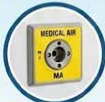
مأخذ هواء طبي